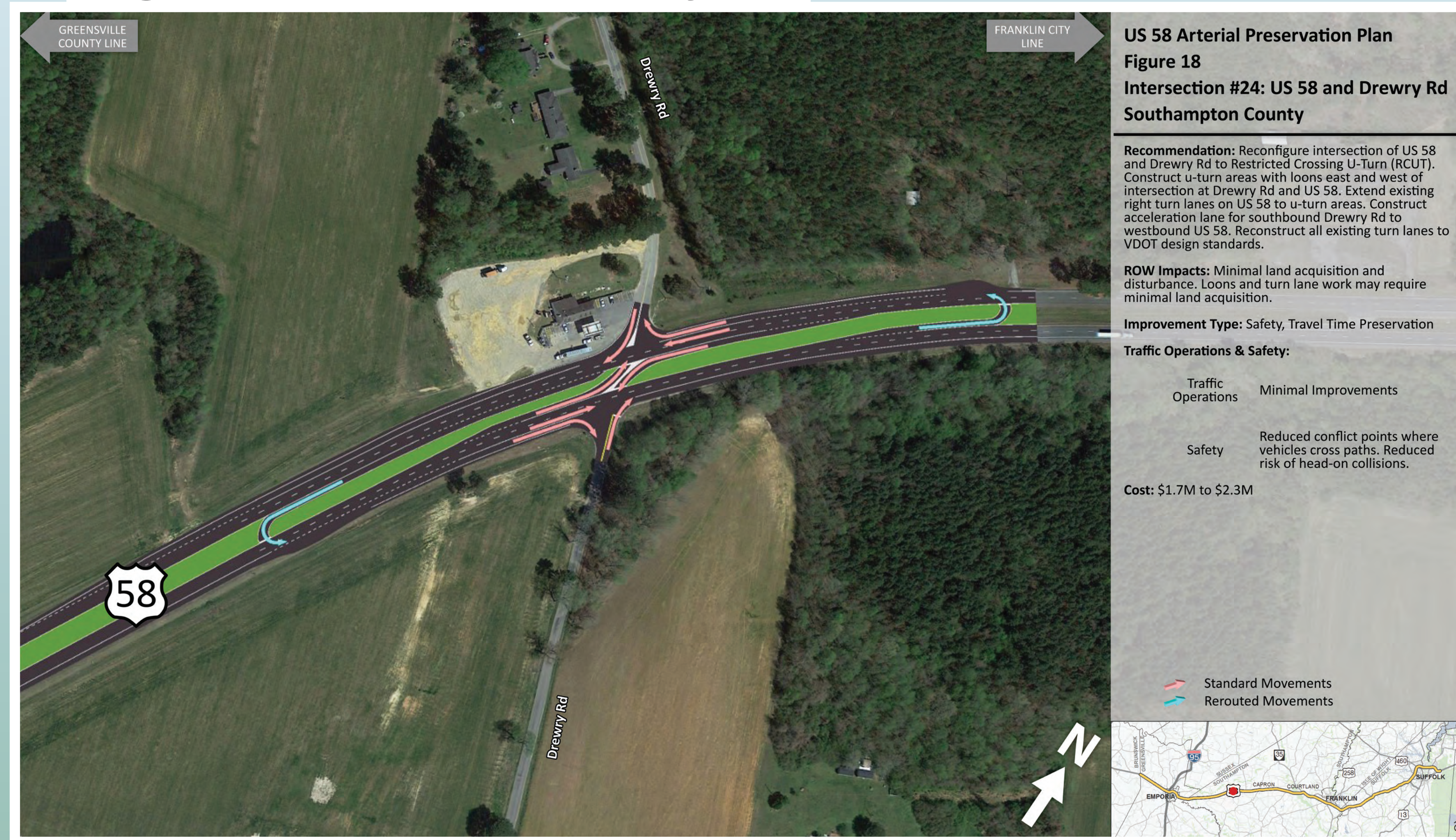
Figure 18. US 58 and Drewry Rd