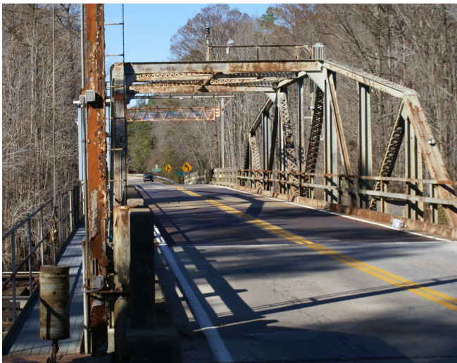
Existing South Quay Bridge over Blackwater River.