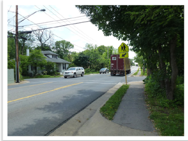
Figure 2 Swan Avenue at S. Buckmarsh Street

Students who live east of the school or who walk to Rixey Moore Park must cross S. Buckmarsh Street (US 340). The crossing at Swan Avenue is the most conveniently located crossing across S. Buckmarsh Street near the school; however, it is perceived as dangerous due to high motor vehicle speeds and volumes and increasing truck traffic. US 340 connects Berryville to Front Royal and other nearby towns.