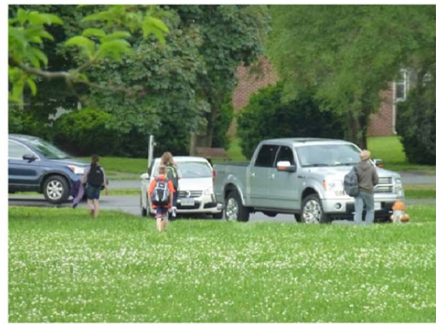
Figure 5 Students walking across the grass to Swan Avenue.

At dismissal the walkabout team observed that most students walking toward Tyson Drive did not use the campus pathway system to connect to the sidewalks on Tyson Drive. Instead, they took a more direct route across the grass. Similarly, the walkabout team observed that many of the students who exited campus toward Swan Avenue preferred to walk across the grass rather than take a less direct route along the campus pathway system. In the debriefing