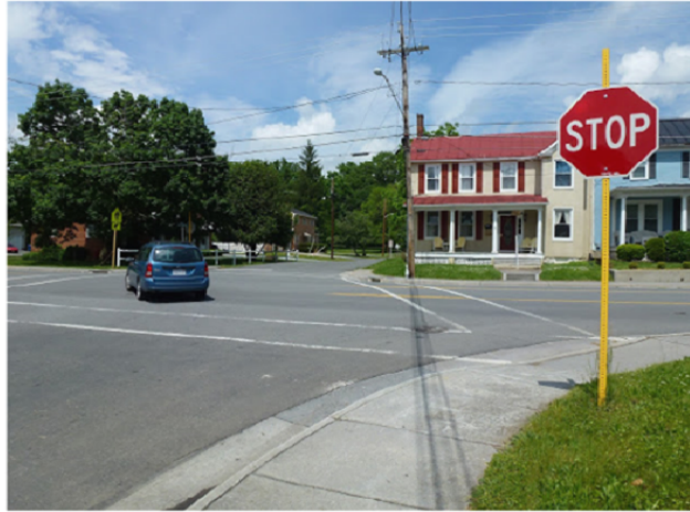
Figure 4 W. Main Street at Lincoln Avenue

Students who live north of campus must cross W. Main Street (VA 7), and the crossing at Lincoln Avenue is the most conveniently located crossing across W. Main Street (VA 7) near the school. The intersection is stop controlled for traffic on Lincoln Avenue and uncontrolled for traffic on W. Main Street (VA 7). A school staff member assists students crossing at this location. There are standard “parallel line” marked crosswalks for all legs of this crossing, which is supported by school crossing signs and a school pavement marking oriented to westbound traffic. However, the crosswalk for the east side leg is skewed, increasing pedestrian crossing