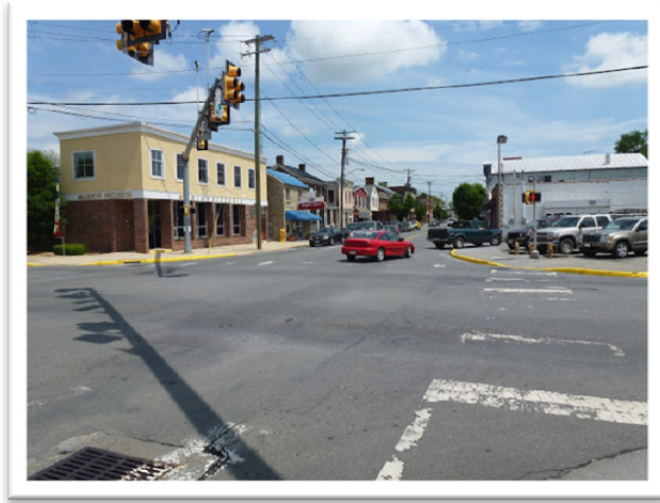
Figure 3 S. Buckmarsh Street at W. Main Street

For students walking to Rixey Moore Park, the best location to crossing S. Buckmarsh Street (US 340) at Swan Avenue is to cross S. Buckmarsh Street (US 340) at W. Main Street (VA 7). This intersection serves two major roadways connecting Berryville to nearby towns. Buckmarsh Street in particular serves truck traffic through Berryville. The intersection is signalized and includes high-visibility "piano key" marked crosswalks and pedestrian signal heads; however, the marked crosswalks are nearly worn away and are slightly skewed on the north, east, and west legs, increasing pedestrian crossing distance, and the pedestrian push buttons do not meet current ADA guidelines. All of the intersection approaches prohibit turns on red and all approaches also have a left-turn pocket with a through/right lane. Curb ramps at the intersection are not ADA compliant and there is limited pedestrian waiting area on the corners. Signal timing does not "rest in walk," meaning pedestrians only get the WALK indication for a few seconds before the flashing DON'T WALK indication followed by the DON'T WALK indication while concurrent traffic still has the green indication.