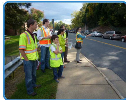
Participants during a Walkabout at Walker Upper Elementary School, Charlottesville